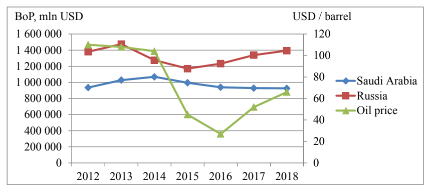
Figure 3. Investment Position to Oil Prices Correlation